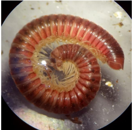
Figure 2: 'Pink' Tachypodoiulus niger from Cally Gardens; left male, right female.