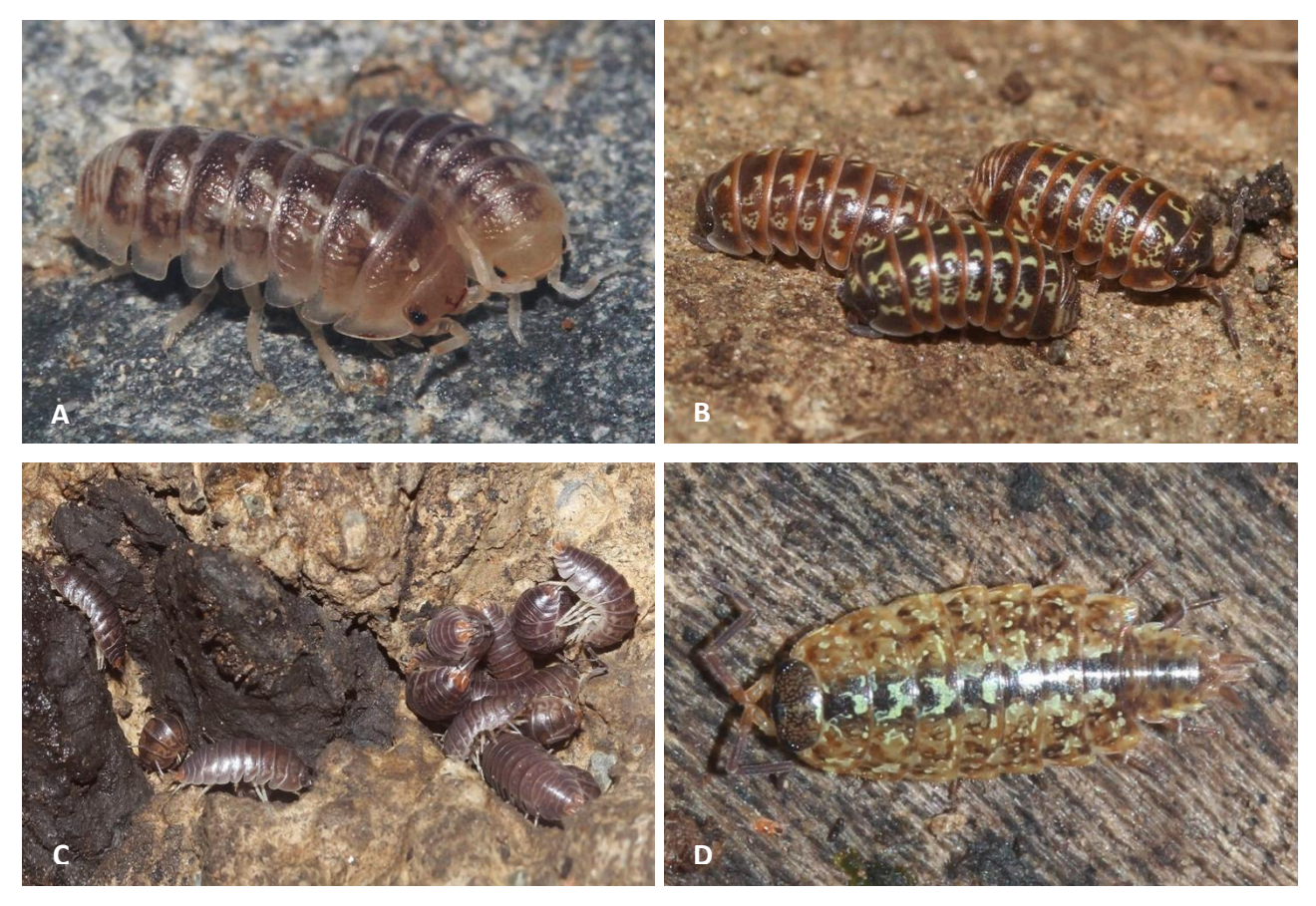
Figure 3: Terrestrial Woodlice recorded during the BMIG 2019 field meeting. A) Armadillidium album from upper drift line at Ringdoo Point; B) Armadillidium pulchellum from coastal grassland at Mullock Bay; C) Group of Cylisticus convexus at Cally Gardens; D) Philoscia affinis male from coastal grassland at Ringdoo Point.

Overall the coastal sites proved the most interesting (see also Intertidal Isopods below). Trichoniscoides saeroeensis was recorded from three sites. Good numbers of Armadillidium album were recorded from Ringdoo Point, Luce Sands (site 14) (Fig. 3A). This species was first recorded there in 1974 (Harding, 1975), at its only known Scottish site (Gregory, 2009). Similarly, large numbers of Armadillidium pulchellum were seen at Mullock Bay (site 21) (Fig. 3B), where the species was also recorded during the in 1997 field meeting. Cylisticus convexus was also recorded from the coast at Craignarget (site 3) and also in unusually large numbers at Cally Gardens (site 15) (Fig. 3C).