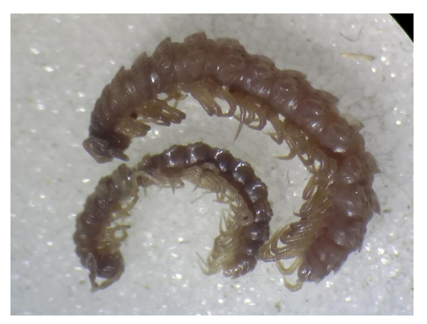
Figure 1: Relative size of Polydesmus males collected from Lamorran House Gardens. Polydesmus taranus (top) c. 10.5 mm in length; Polydesmus asthenestatus (below) c. 8.5 mm in length.

online group (IMBI, 2021) were provisionally identified as Polydesmus taranus Verhoeff, 1936 by Per Djursvoll who subsequently confirmed this determination following examination of a male specimen.