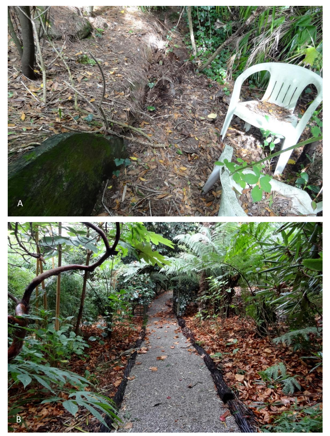
Figure 4: Deep accumulations of leaf-litter under shrubs at Lamorran House Gardens where both Polydesmus taranus and P. asthenestatus were recorded.

taranus has been repeatedly confused with P. asthenestatus (both were initially included under the name P. dispar Silvestri, 1895) (Kime & Enghoff, 2011). This was highlighted by Mauriès (1969) who found that material collected in 1902 and attributed to P. dispar (now considered a synonym of P. asthenestatus by Millibase, Sierwald & Spelda, 2022) actually contained male specimens of both P. taranus and P. asthenestatus . In Demange (1981) both species key out together under the name P. asthenestatus /P. taranus (?), but gonopods of both species are illustrated (i.e. figs. 175 and 174, respectively).