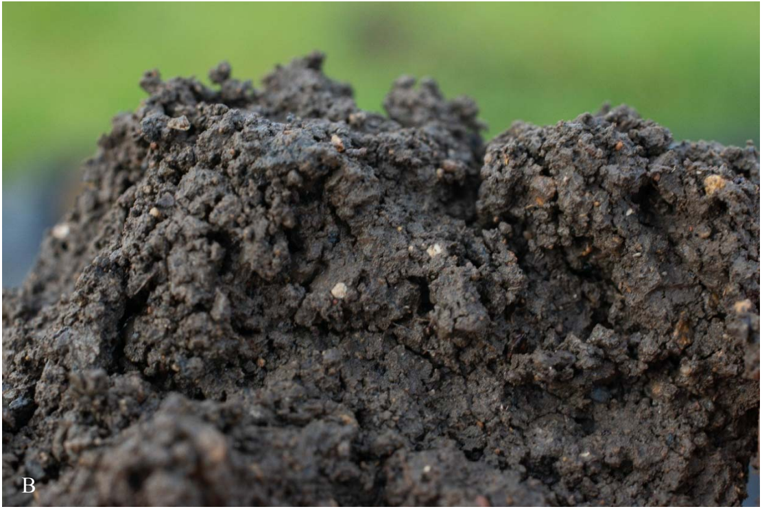
Figure 3: Habitat of Metatrichoniscoides celticus at Horfield Allotments. A) Bare allotment soil from which specimens were collected; B) Closeup on soil macropores.