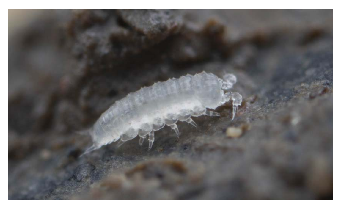
Figure 1: Metatrichoniscoides celticus immature live specimen from Horfield Allotments. Live macrophotograph in-situ.

macrophotograph was posted online to BMIG's Isopods and Myriapods of Britain and Ireland group (www.facebook.com/groups/ 407075766387553) by FA (Fig. 1). The image drew a lot of attention and subsequently FA forwarded the preserved specimens to SJG for species determination.