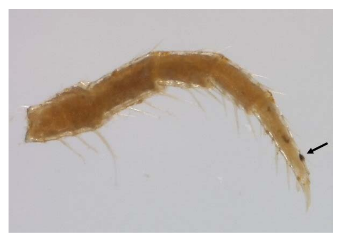
Figure 2: Leg of O. germanicus with one 'enigmatic fungus' on the tarsus, showing the black point of attachment (arrowed).

Although there were no Laboulbeniales fungi on the Trap Grounds specimens, there were some other fungi growing singly on the tibia or tarsus of the legs. These fungi are much smaller than T. rossii , and lie appressed to the leg making them difficult to spot; the black point of attachment is more conspicuous than the thallus (Figs. 2, 3). They very much resemble (Henrik Enghoff, in litt. ) the unidentified 'enigmatic fungi' found on Xestoiulus laeticollis (Porat) and O. pilosus (Newport) (Diplopoda: Julida: Julidae) in Denmark and illustrated in Figures 2 and 3 of Enghoff & Reboleira (2017).