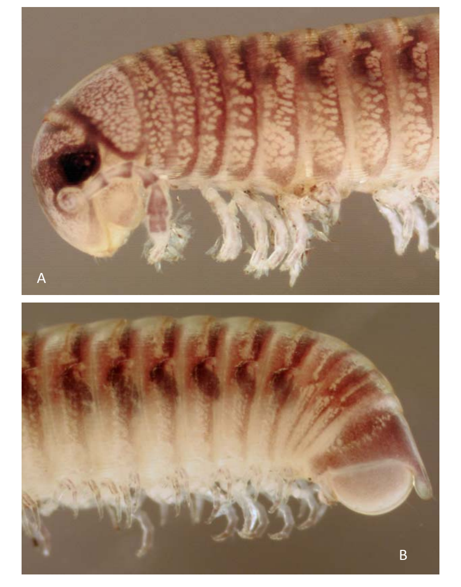
Figure 1: Cylindroiulus punctatus.

In the UK the fungus is mainly found on Cylindroiulus punctatus (Leach) (Figs. 1A, 1B), but was originally described from C. latestriatus (Curtis) in the Netherlands (de Kesel et al. , 2013). The tiny thalli (technically ascomata/ascocarps; fruitbodies) appear on the first few legs, especially the second pair (de Kesel et al. , 2013; Santamaria, et al. 2016) but are by no means confined to these.