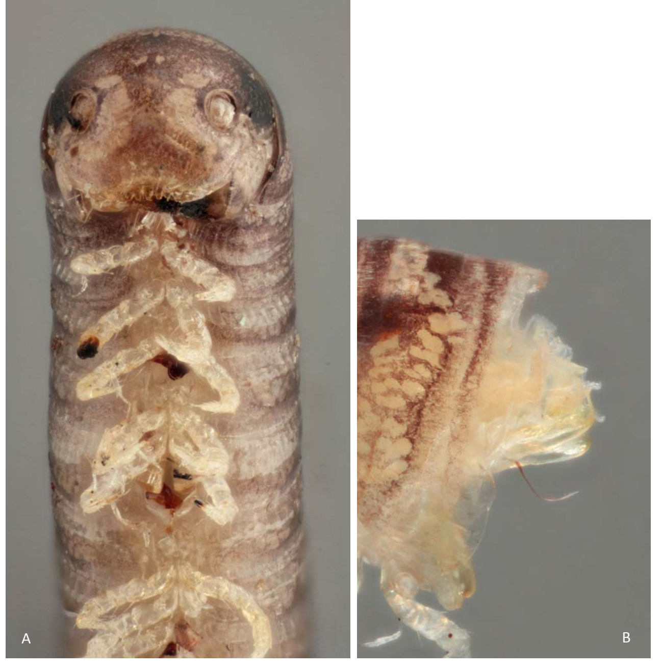
Figure 2: Cylindroiulus britannicus.